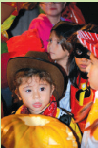
Above: costumes and pumpkin carving