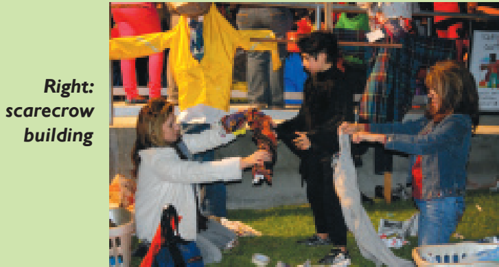
Right: scarecrow building