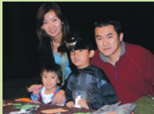
Left: family crafts