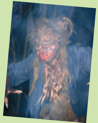
Above: Halloween werewolf