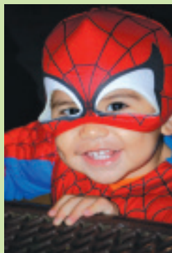
Right: "Spider-Man" having fun