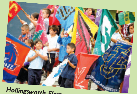
Hollingsworth Elementary students wave college banners during the West Covina school's "No Excuses" university rally promoting college attendance.