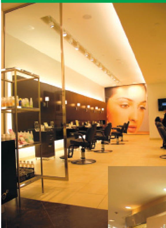
Ziba Beauty at Westfield West Covina