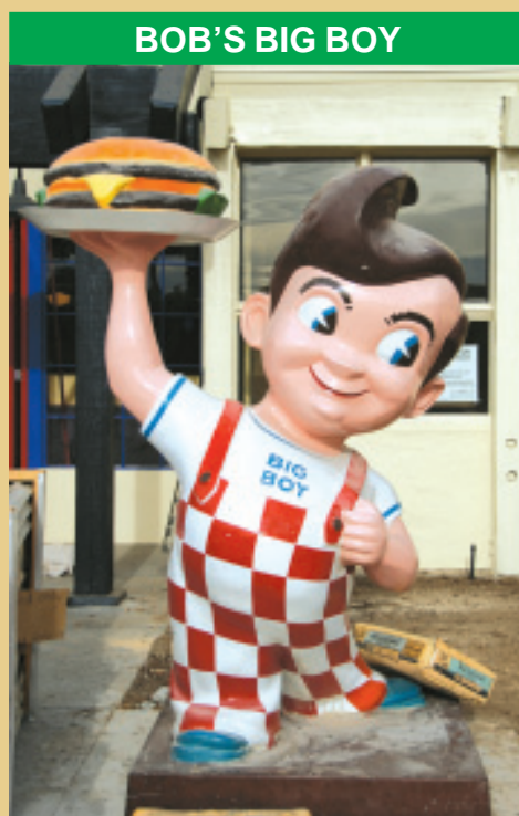
BOB'S BIG BOY

Bob's Big Boy – Bob's Big Boy Restaurant is now open for business at the former Chevy's building located across from Westfield West Covina.