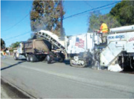
Francisquito Avenue - Grinding old pavement

Major Street Rehabilitation – All American Asphalt completed paving on Francisquito Avenue, Merced Avenue, West Garvey Avenue South, Puente Avenue, East Garvey Avenue South and Badillo Street. The cost for this project is approximately $1.8 million, and it is funded from Proposition 1B.