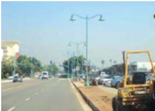
Glendora Avenue - New lighting

Glendora Avenue Improvements - New street lights have been installed and turned on. Trellises have been painted. New benches and trash cans have been installed. New irrigation and landscaping is also part of the improvement project. The cost for this project is $447,661.50.