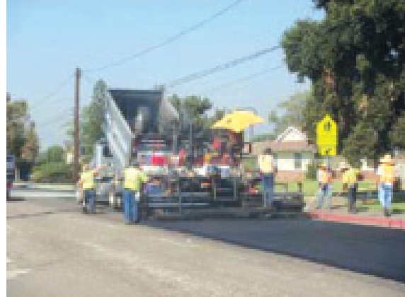
Francisquito Avenue - Placing new asphalt

Glendora Avenue Improvements - New street lights have been installed and turned on. Trellises have been painted. New benches and trash cans have been installed. New irrigation and landscaping is also part of the improvement project. The cost for this project is $447,661.50.