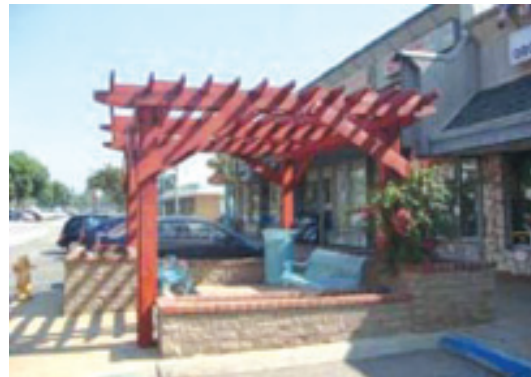
Glendora Avenue - Trellises painted