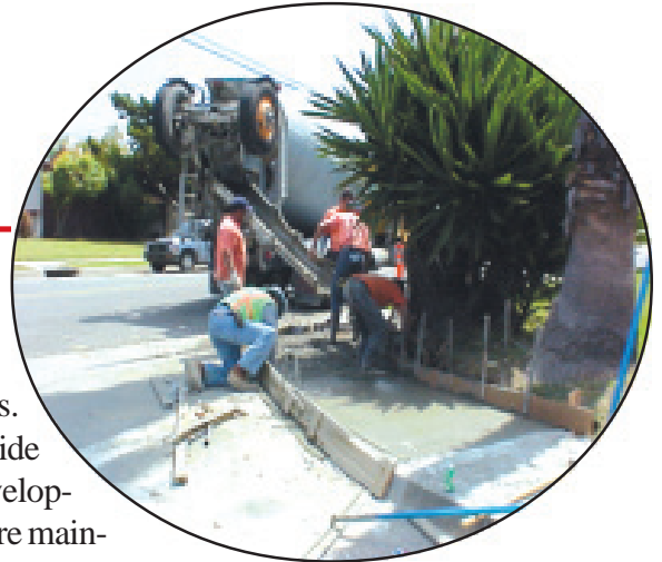
Above: A public works maintenance crew installs a handicap ramp.

Public works professionals include those individuals who work in the building, engineering and maintenance divisions. These are the people who provide community enhancement, development services and infrastructure maintenance that are vital to the community's health, safety and comfort.