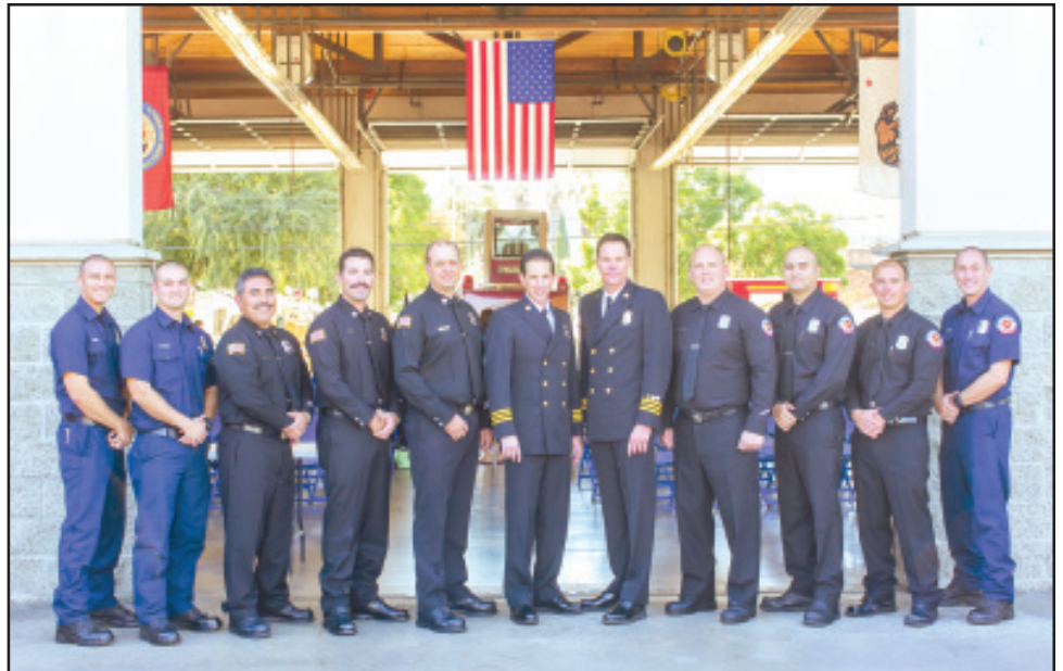
The above photo shows West Covina Fire Department members at a recent badge-pinning ceremony. The West Covina Fire Department promoted eight firefighters and hired three new ones.