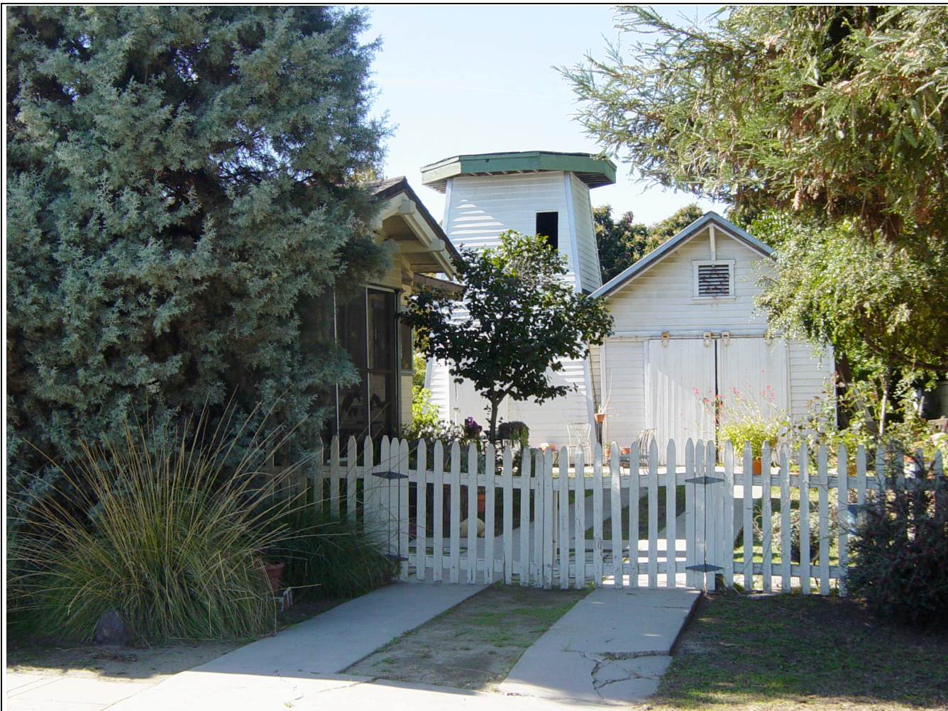
Single car garage and water tower