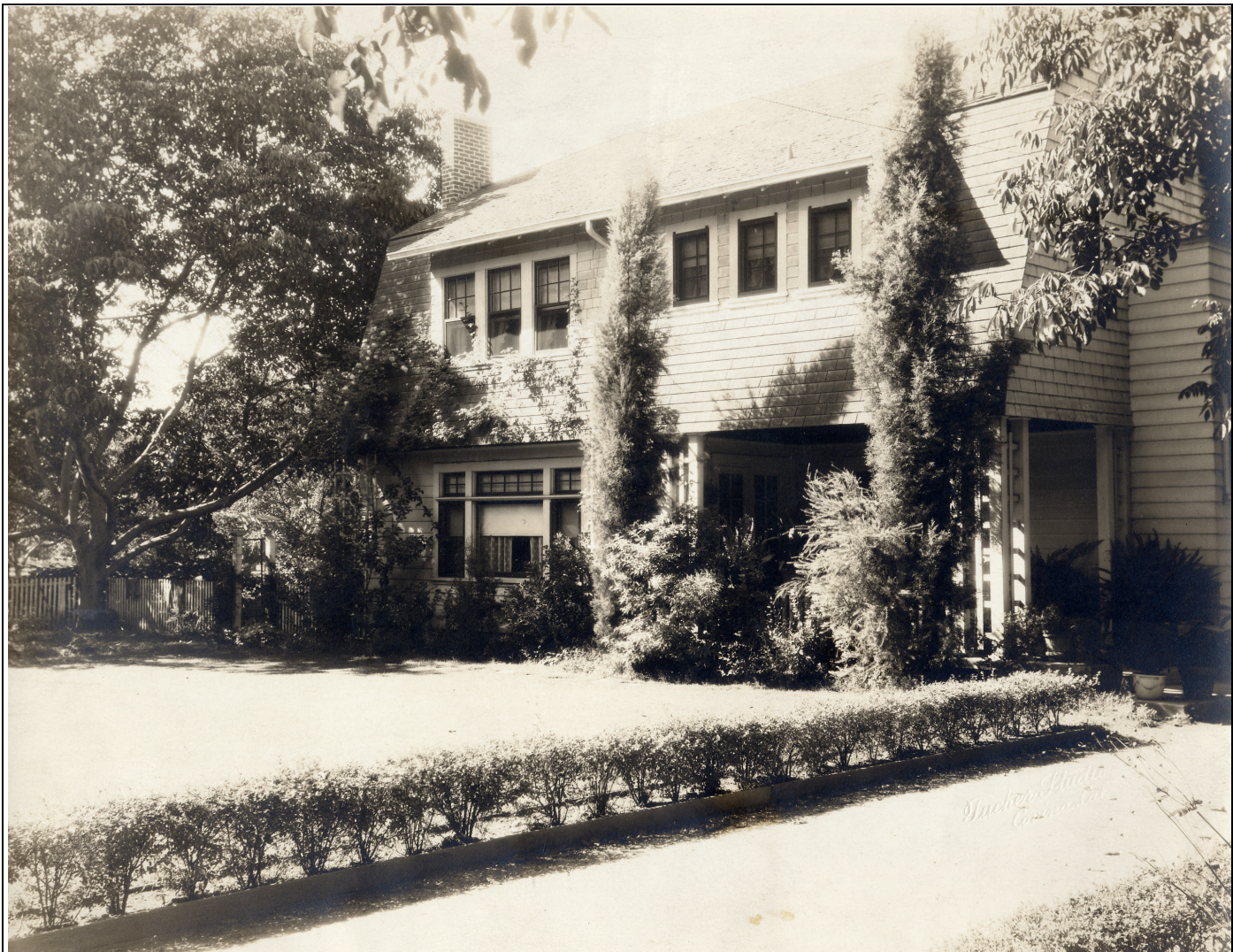
137 S. Lark Ellen Historic Photograph