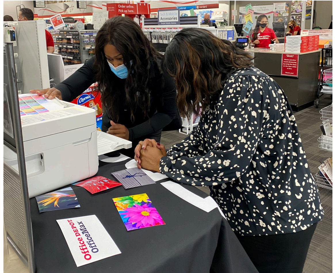
OFFICE DEPOT SHOPPING SPREE – WEST COVINA HIGH SCHOOL