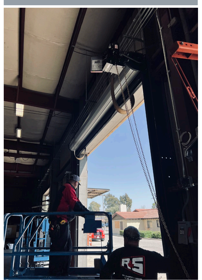
Fire Station I