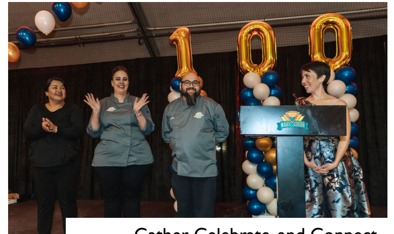
Gather, Celebrate, and Connect