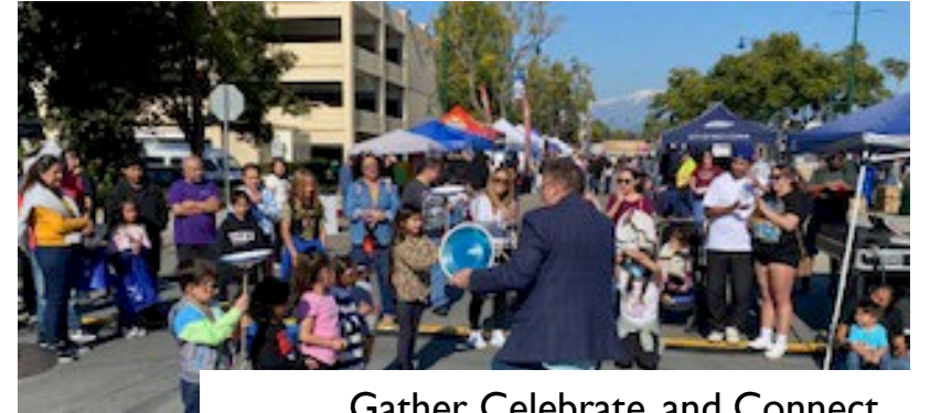
Gather, Celebrate, and Connect