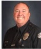
OFFICER MOSLEY MIDDLE SCHOOLS