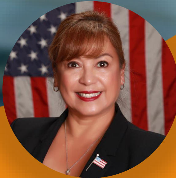
Mayor Rosario Diaz