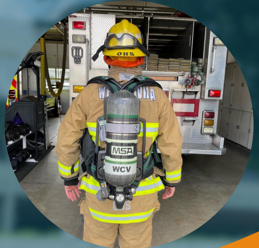
ONE OF THE NEW SCBAs