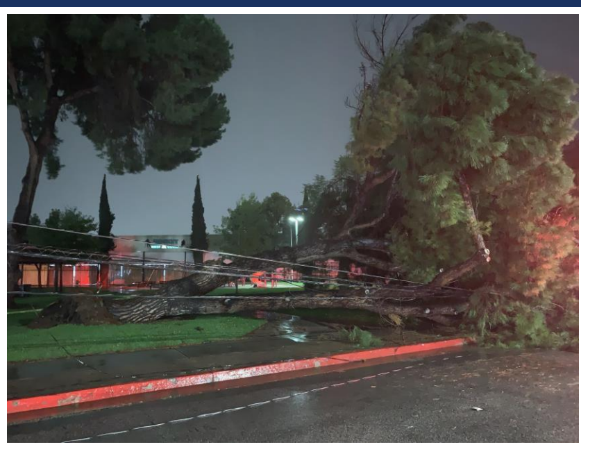
Fallen tree at Orangewood Park