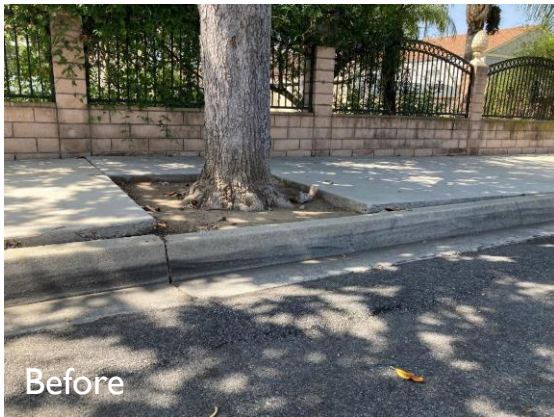
936 E. Vine Avenue | Sidewalk Trip Hazard Repair